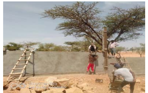
School's concrete fence