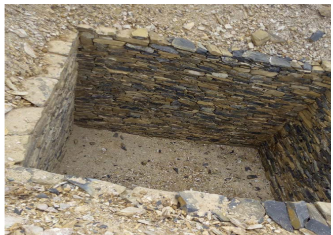
School latrine construction