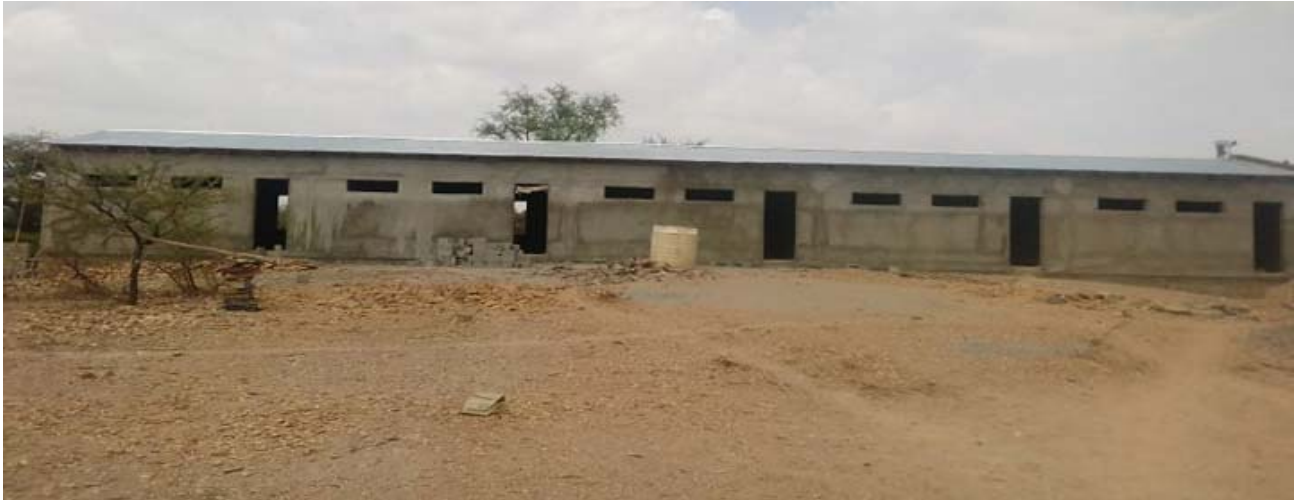
one block with five class rooms (5-8 th )