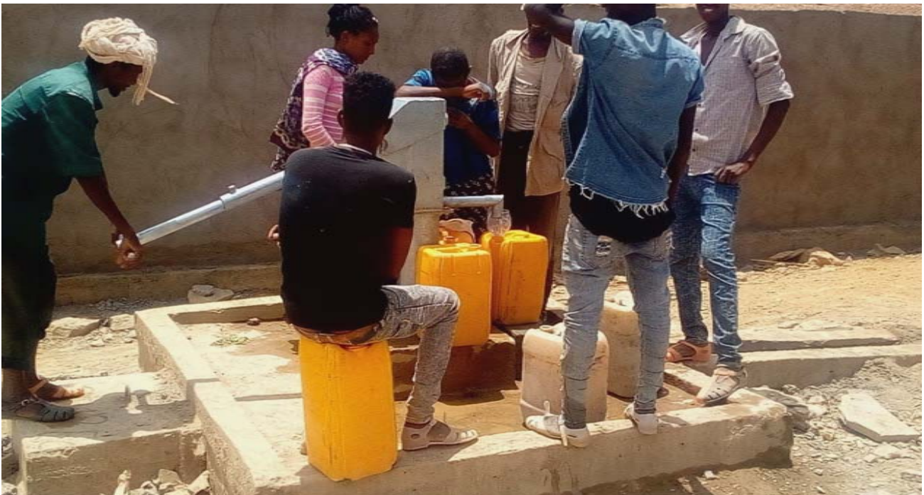
School water well